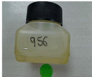
View of content (1mm x 1mm scale)