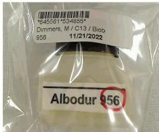
Package received - labeling COC

Laboratory Number Beta-645561 Percent modern carbon (pMC) 70.20 +/- 0.21 pMC Atmospheric adjustment factor (REF) 100.0; = pMC/1.000